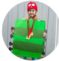
The Very Hungry Caterpillar