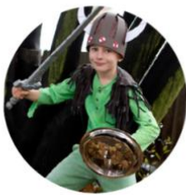
Hiccup Horrendous Haddock III

World Book Day is here again! We will be celebrating World Book Day on Friday 3 rd March. We hope all the children will come to school dressed as their favourite story character. There will be prizes for the children who have really thought about the characters they would like to be. There are lots of ideas on the World Book Day site for simple costumes that are not expensive to make. http://www.bookaid.org/support-us/world-book-day/world-book-day-dress-up/