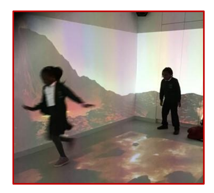
"Our Holodeck is cool! We can jump through volcanoes, visit the jungles of Africa and even swim in the deep oceans!"