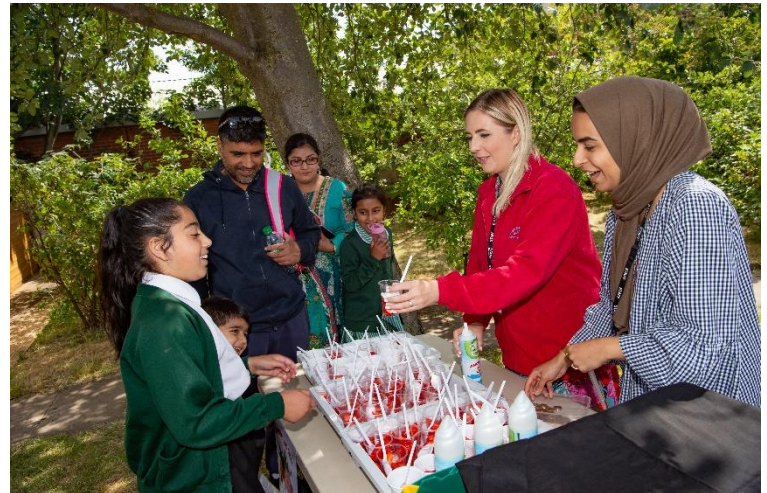
Garden Party 2019